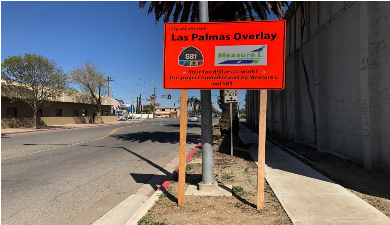
Paving at Las Palmas Avenue and First Street